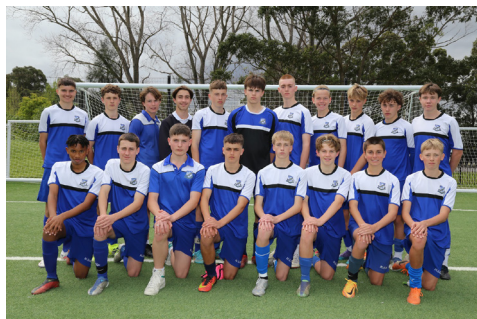
2022 Trophy Winners, Westfields Sports & Cup Winners, Narrabeen Sports