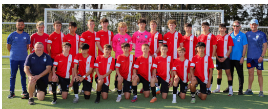
2023 Trophy Winners, Westfields Sports & Cup Winners, Endeavour Sports